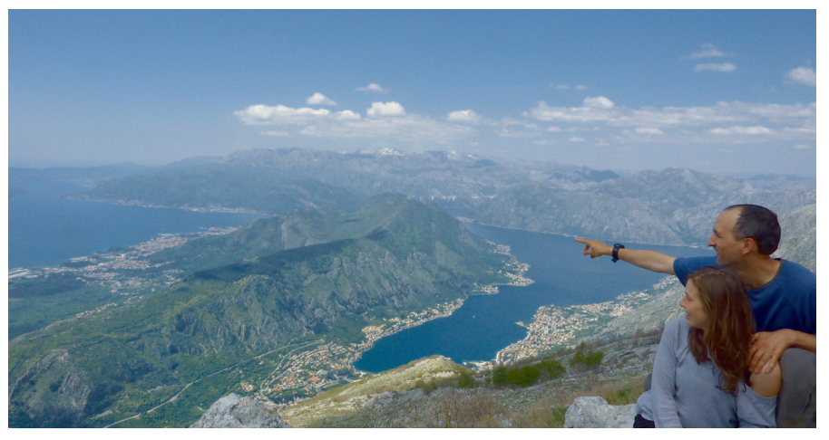
Overlooking Kotor Bay, Montenegro. Kotor's Old Town is just out of sight below.