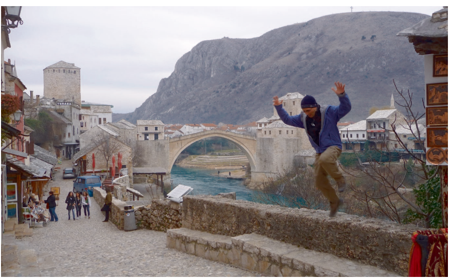
Francis and the Mostar Bridge, Bosnia. Courageous ones jump off the bridge.